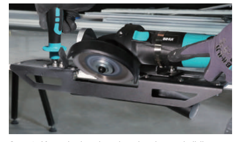
Step 2. Keep the bearing close leaning and sliding on the edge of tile (slab)