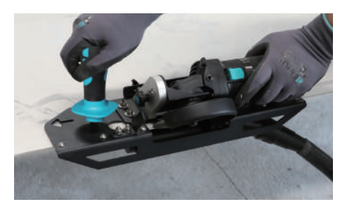
Step 3. Move forward steadily to make a perfect bevelling.