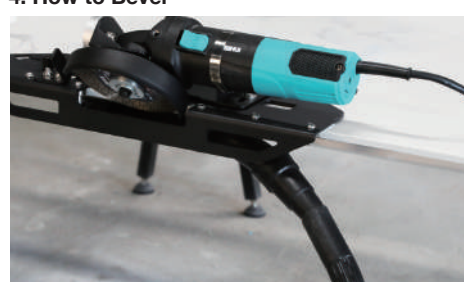
Step 1. Connect to the vacuum cleaner