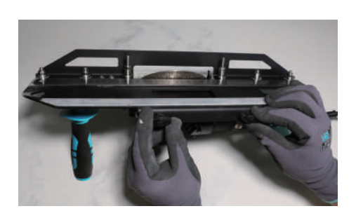
Step 2. Turn the adjusting screws in colockwise/counterclockwise,keep both screws adjusted. Colorwise turn to get thinner cutting edge Counterclockwise to get a thicker cutting edge