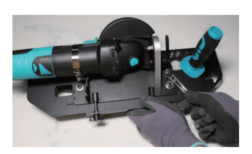
Step 3. Tighten the scews