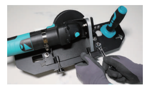
Step 1. Loose three screws