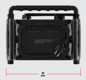
WEIGHT 3.4 KG

The Rockbox can be used in most work settings